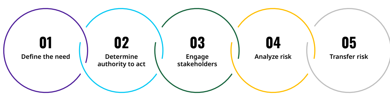
Exhibit 5: Potential roadmap to implementation

Note, as stated above, this framework is iterative. It may be that risk analytics are needed to fully define the need. The community may need a better understanding of the disaster risks in the community before it can fully articulate the specific groups and types of coverage needed. For example, a community may know that it has experienced flooding beyond the high-risk areas on FEMA maps but may not have a clear idea which areas in the community are most at risk and what that full risk profile is for different types of flooding.